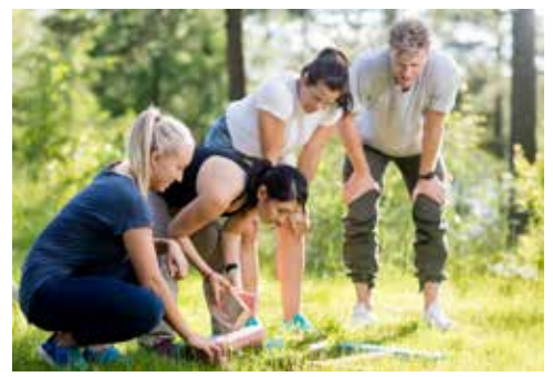
Compete in Teambuilding