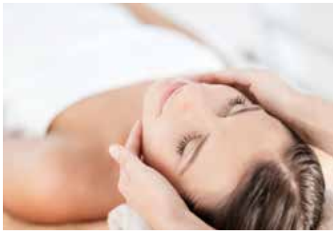
Meet, Relax & De-Stress