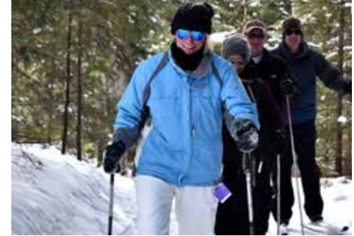
Hit the Trails after Meeting

Plan your next meeting with a side of adventure. Our team can set up nearly any activity you can think of. (Well, maybe not whale watching, we are in Michigan after all). Take your group rafting or canoeing down the Sturgeon River, on a sleigh ride through the winter woods, host a beer pairing dinner with local ingredients, ride the chairlifts in full fall color, or even plan a paint and sip with mini spa services! Activities planned by us make it easy for you and your attendees. We can even arrange transportation for group sightseeing or off-site leisure activities.