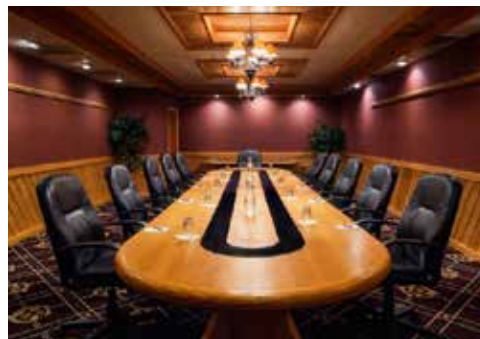
Signature Board Room