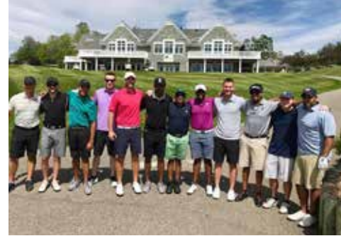
Meet on the Golf Courses