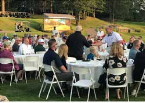
Take the Meeting Outside