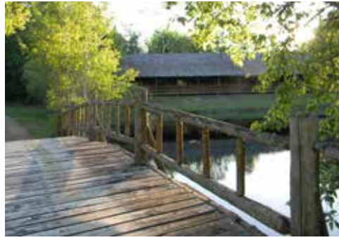
Meet in the Woods